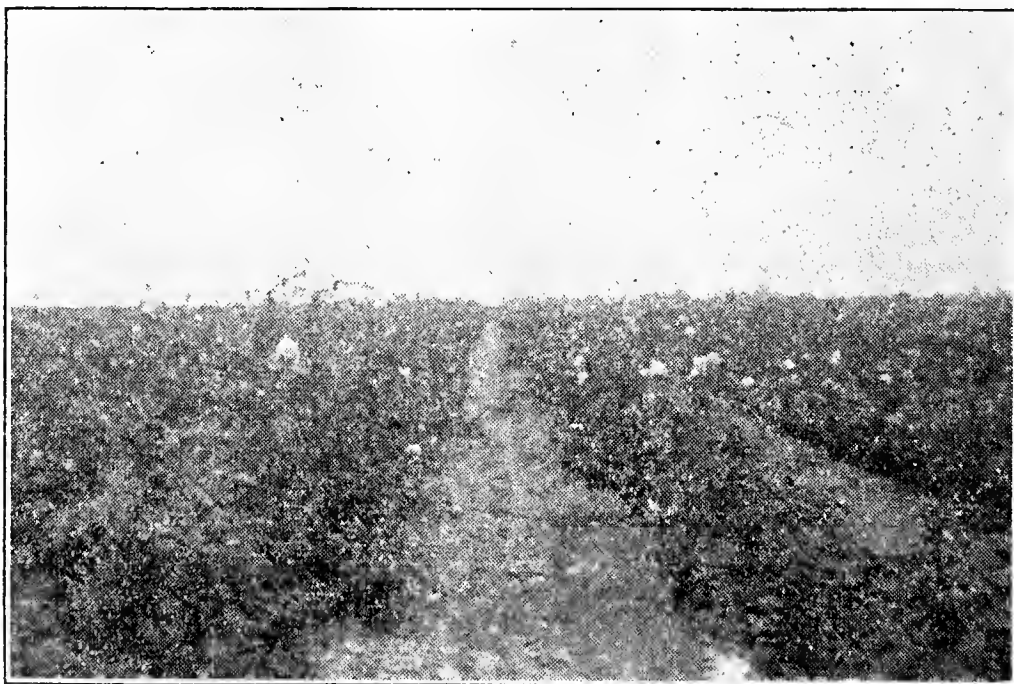
Acre of the famous Locke Roses growing in our rose fields

Souvenir de Claudius Pernet Golden Emblem — Mabel Morse Red Radiance — Etoile de Holland Sensation — Sunburst — Padre Radiance — Angelo Pernet